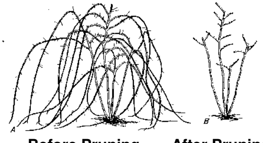
Before Pruning After Pruning

When one-year-old canes arising in the spring reach a height of 18-24 inches, they should be pinched back 3 or 4 inches. This practice forces out strong fruiting laterals for next year's berry crop. No more attention is paid to the canes after pinching until time for pruning in late winter. During winter, the old two-year-old wood that fruited the previous summer is removed, and the laterals or branches that arose after summer pinching of the one-year-old canes may be shortened to about 12 inches. Of course, any weak canes may also be removed at this time. The properly pruned plant has a globe shaped, hedge-like appearance with the fruit occurring on the outside surface of the bush. Staking may be beneficial for the first crop of a new planting, but is not needed after that.